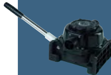
Mk 5 Universal Pump 5 Year Warranty